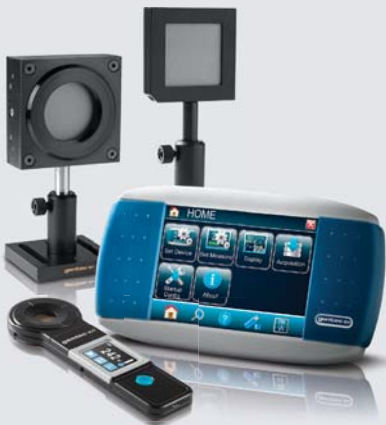
POWER & ENERGY METERS