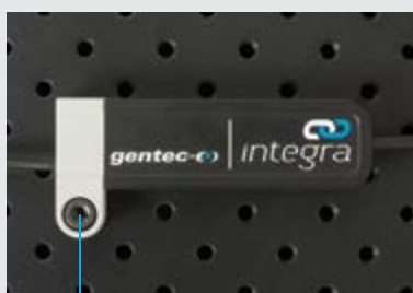
Secure it on your Optical Table

Watch the Introduction video available on our website at www.gentec-eo.com