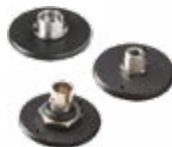
Fiber Adaptors & Connectors (FC, ST or SMA)