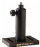
Stand with Delrin Post (Model Number: 200428)