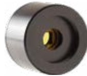
PE5B-Ge (5 mm - Germanium)