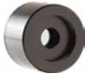
PE3B-Si (3 mm - UV-Silicon)