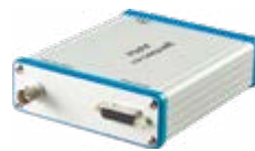
APM Analog Power Supply (Model Number: 201848) See page 57 for specs.