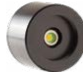
PE3B-In (3 mm - InGaAs)