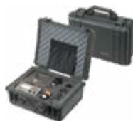
Pelican Carrying Case

This product cannot be used with DB-15 extension cables