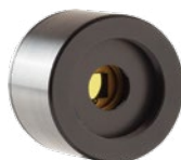
PE5B-Ge (5 mm - Germanium)