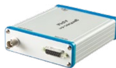
APM Analog Power Supply (Model Number: 201848)