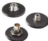
Fiber Adaptors & Connectors (FC, ST or SMA)