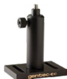
Stand with Delrin Post (Model Number: 200428)