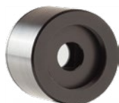
PE3B-Si (3 mm - UV-Silicon)