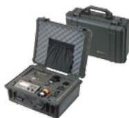
Pelican Carrying Case

This product cannot be used with DB-15 extension cables