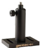
Stand with Delrin Post (Model Number: 200428)