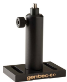
Stand with Delrin Post (Model Number: 200428)