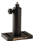
Stand with Delrin Post (Model Number: 200428)